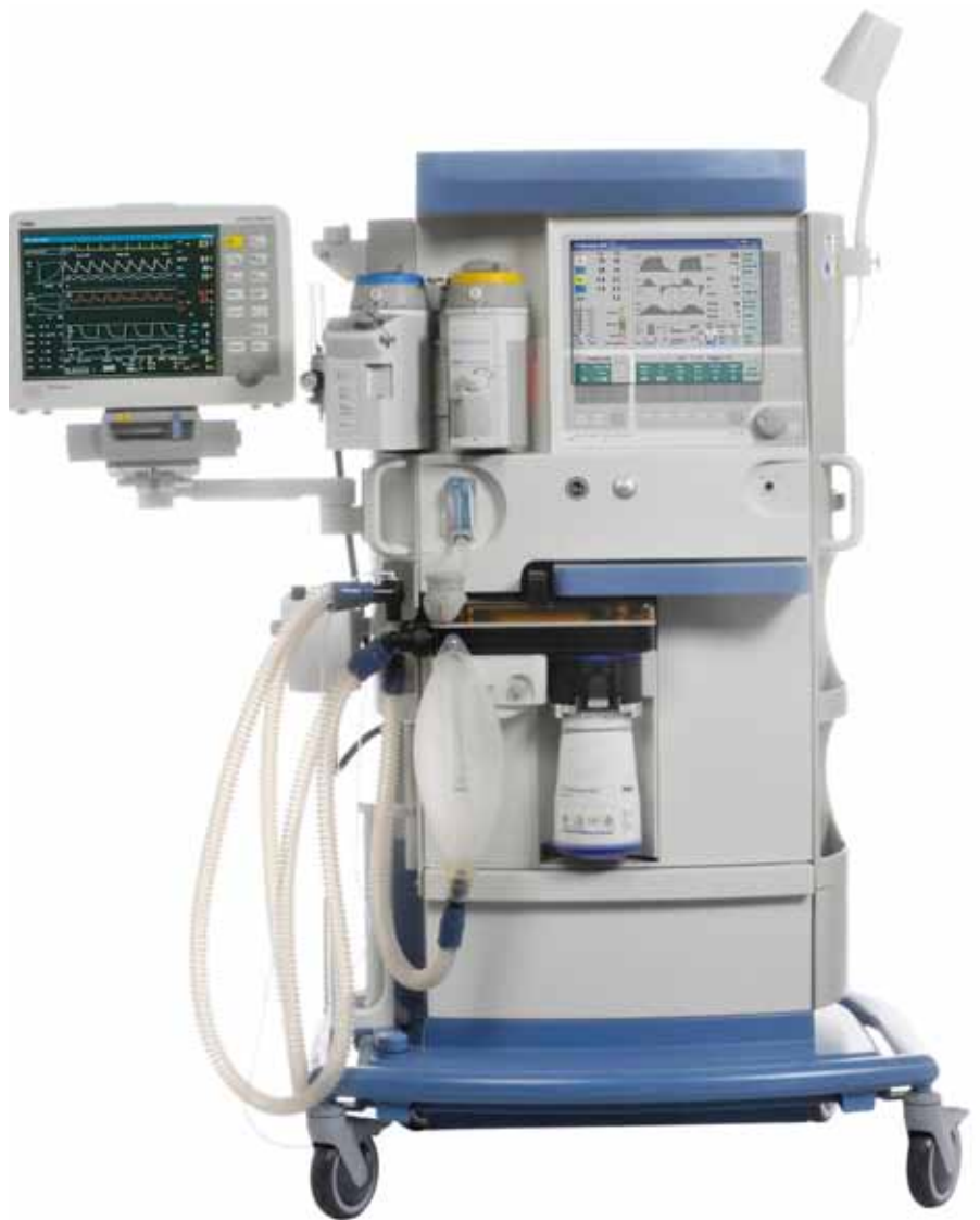
Anaesthesia machines provide an essential medical pipeline of air supply and pain management during surgery, ensuring safe anaesthesia for patients.